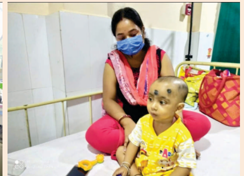
Visit to ICH Paediatric Cancer Ward by "Life Beyond Cancer Team" on 16th July, 2022