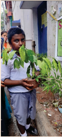
Tree Plantation at CHITTARANJAN JATIYA VIDYALAYA