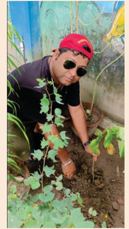
Tree Plantation at HARISH PARK