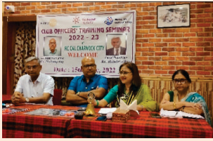
Club Assembly, COTS & 458th RM on 15th June, 2022