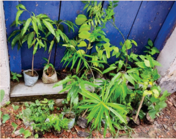
Tree Plantation at CHITTARANJAN BOYS SCHOOL