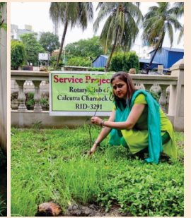
Tree Plantation at EMC