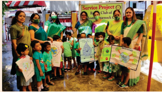
Tree Plantation at TULIP HALL SCHOOL